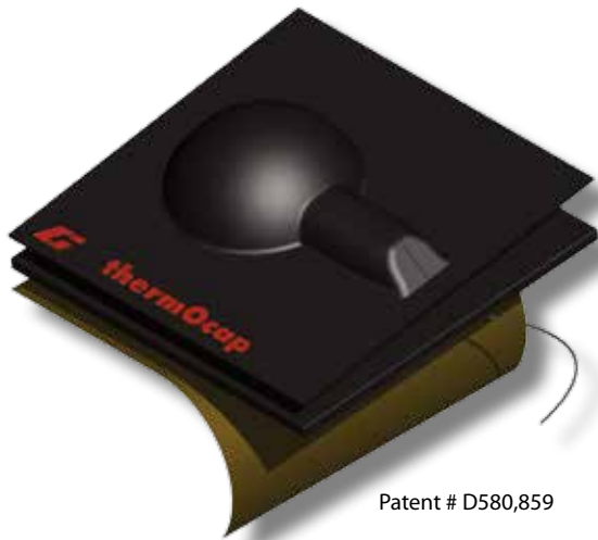
Patent # D580,859