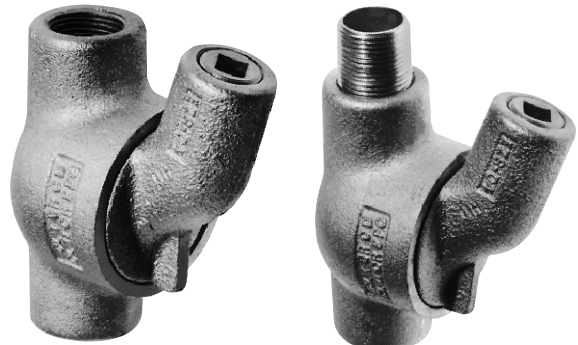
Male & female hub